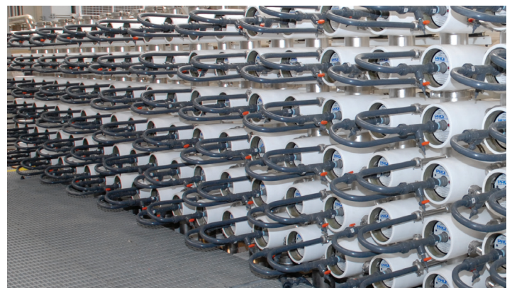
Reverse Osmosis Tubes at Terminal Island Water Reclamation Plant

For more information: www.ladwp.com/RW RecycledWaterInfo@ladwp.com