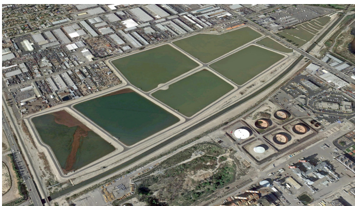
Hansen Spreading Grounds

Implementation is dependent upon funding availability.