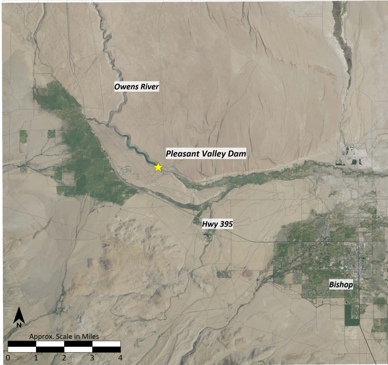
Pleasant Valley Dam Vicinity Map