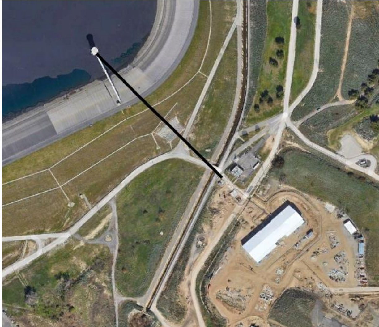
Figure 1 Solid Black Line represents the extent of the Reservoir Outlet Pipeline Relining Project.