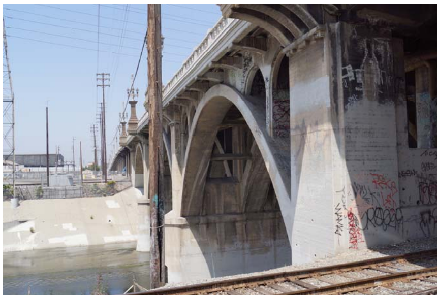
Figure 1. Olympic Boulevard Bridge

The Olympic Boulevard Bridge (originally the Ninth Street Viaduct), built in 1925 is a reinforced concrete open spandrel bridge of the Beaux-Arts bridge design. The bridge is located on Olympic Boulevard as it crosses the Los Angeles River between Downtown Los Angeles and Boyle Heights (Figure 1). The bridge is part of a monumental bridge building program executed in 1909 through 1932 and involved the construction of a series of 12 bridges spanning the Los Angeles River.