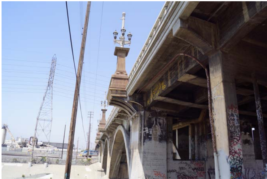
Figure 2. Olympic Street Bridge-view of Decorative Light Fixtures

The bridge rests on four vertical piers in an open spandrel arch form and in a T-beam form on several smaller vertical piers. It exhibits a sculpted concrete railing with heavy double-bellied Classical-style balusters separated by perforated round forms with incised S-shaped foliate petals. Nine pairs of octagonal decorative light fixtures (Figure 2) surmounted by large engaged globes sit atop monumental decorative pylons. Alterations to the bridge include a remodeling in 1985 that removed the decorative pierced balustrade. Seismic work in 1998 to upgrade sections of the pylons and girders also included the restoration of the balustrade (Los Angeles Department of City Planning 2007).