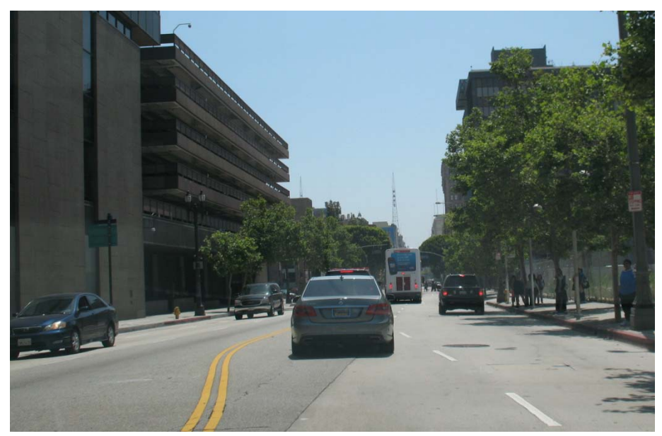
Photo 12. Photo depicting ornamental trees and vegetation present along the Phase II proposed pipeline.