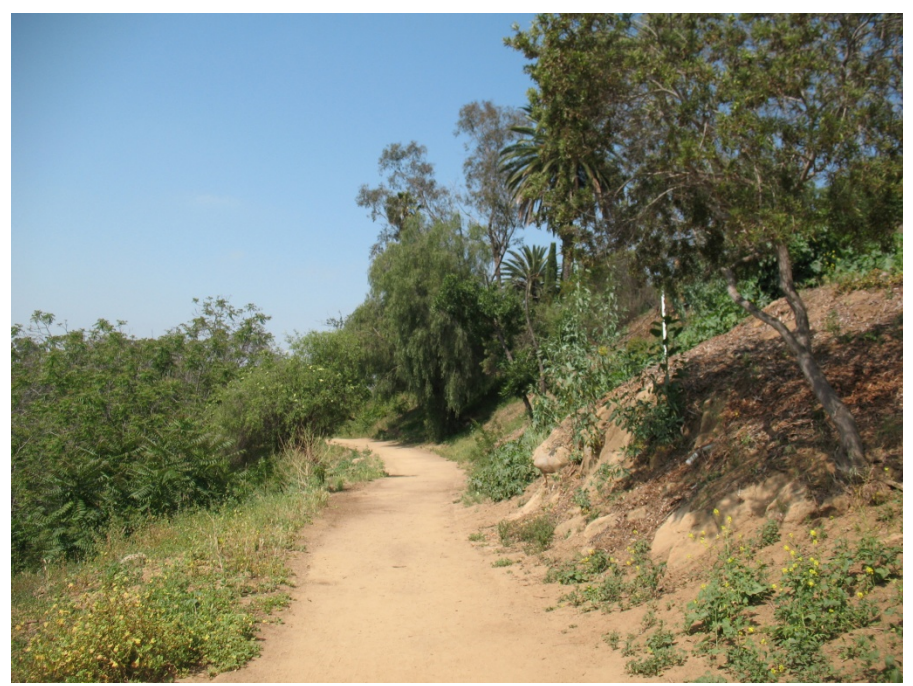
Photo 5. Photo of proposed potable water pipeline route, within an existing compact hiking trail, between Park Drive and paved roads adjacent to Grace E. Simons Lodge and Elysian Park Drive. Photo facing west.