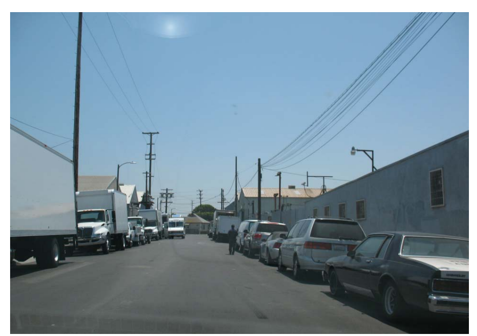
Photo 11. Photo depicting highly-developed and urbanized setting characteristic of the Phase II proposed pipeline.