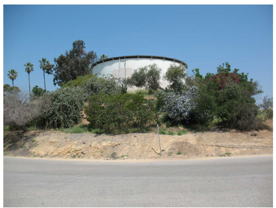
Photo 9. Photo depicting the existing water tank and surrounding habitat on the hilltop by Elysian Fields. Photo facing north.