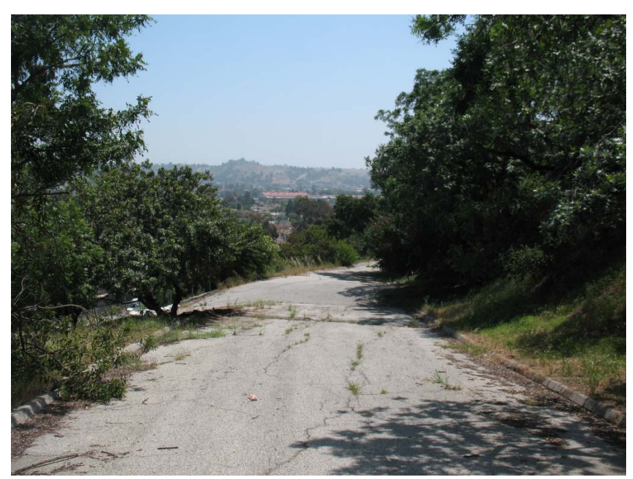
Photo 2. Photo of proposed recycled water pipeline route between Stadium Way and the proposed location for a new recycled water pumping station. Photo facing east.

Photo 1. Photo of proposed potable and recycled water pipelines route and surrounding vegetation along Angels Point Road. Photo facing north.