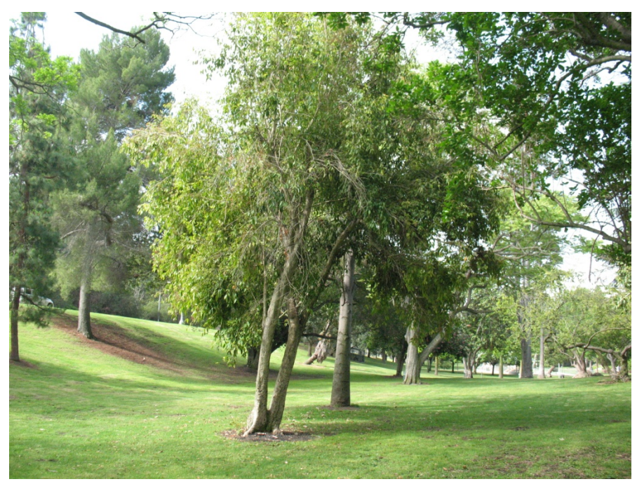
Photo 6. Photo of the proposed site for the new potable water pumping station near the Grace E. Simons Lodge. Photo facing southwest.

Photo 5. Photo of proposed potable water pipeline route, within an existing compact hiking trail, between Park Drive and paved roads adjacent to Grace E. Simons Lodge and Elysian Park Drive. Photo facing west.