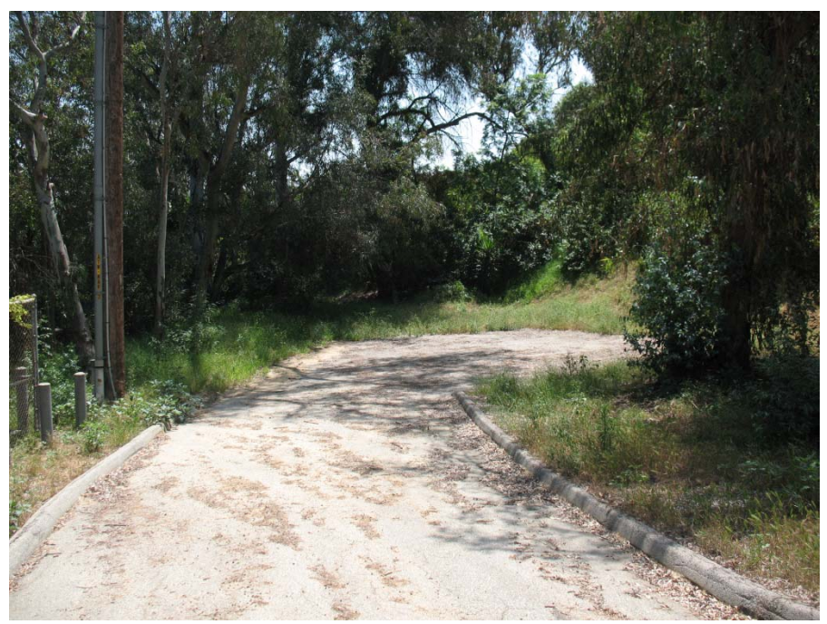
Photo 7. The proposed location for the new recycled water pumping station is a bare area immediately southwest of the Golden State Freeway, directly across from Dorris Place. Photo facing east.