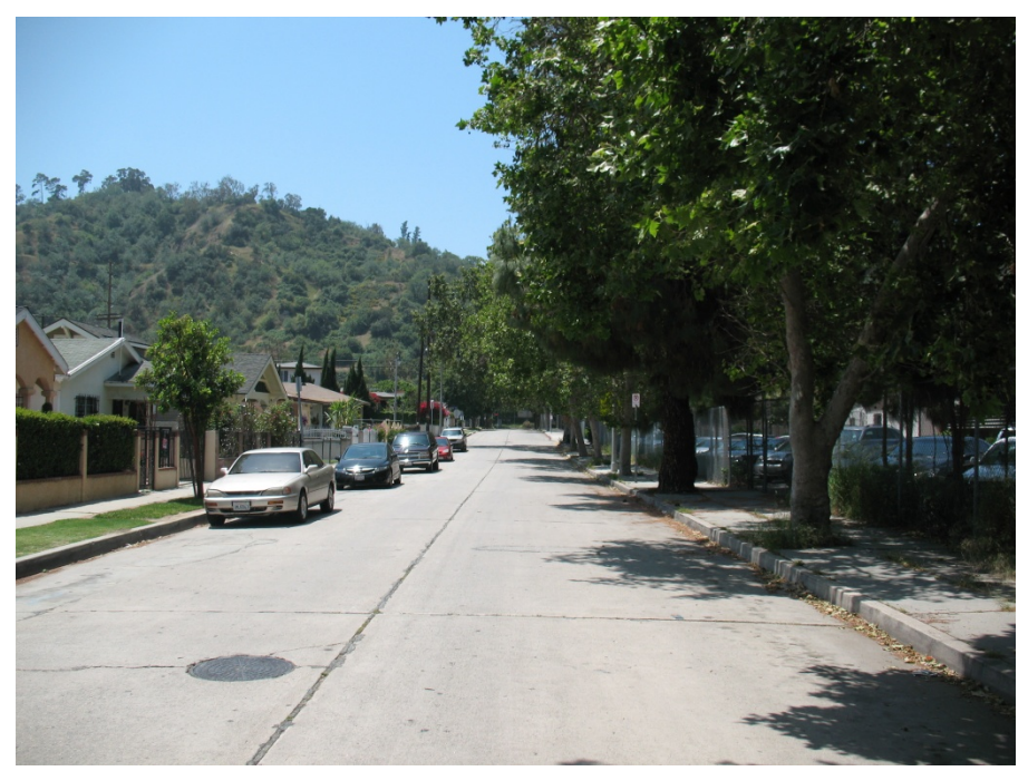
Photo 3. Photo of recycled water pipeline route along Dorris Place. Photo facing northeast.