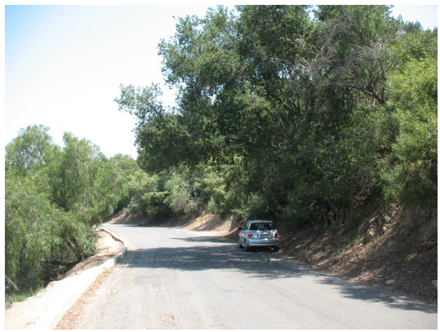
Photo 1. Photo of proposed potable and recycled water pipelines route and surrounding vegetation along Angels Point Road. Photo facing north.