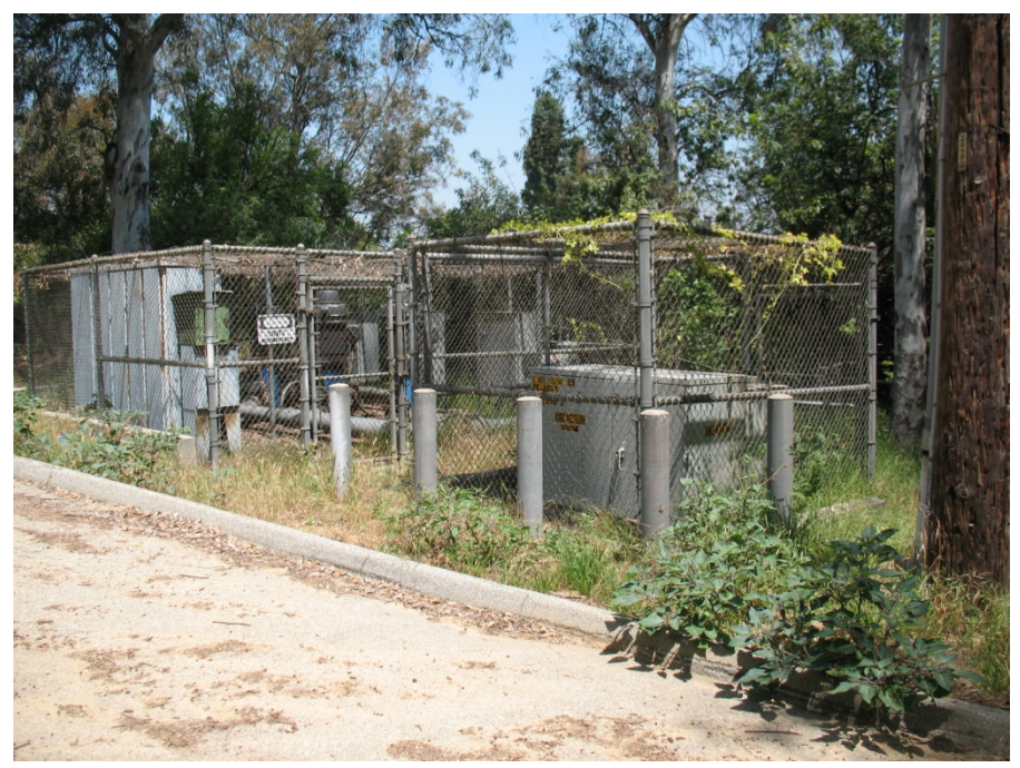
Photo 8. Existing electrical boxes and utilities are located immediately northwest of the proposed recycled water pumping station location. Photo facing north.

Photo 7. The proposed location for the new recycled water pumping station is a bare area immediately southwest of the Golden State Freeway, directly across from Dorris Place. Photo facing east.