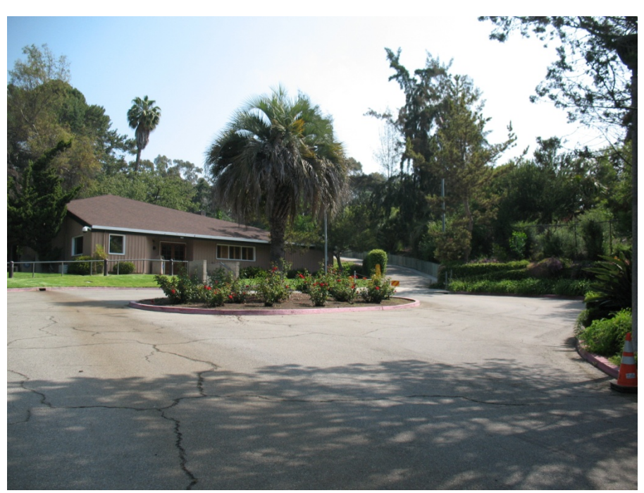
Photo 4. Photo of proposed potable water pipeline route and surrounding vegetation between Elysian Park Drive and hiking trails west of Park Drive. Photo facing north.