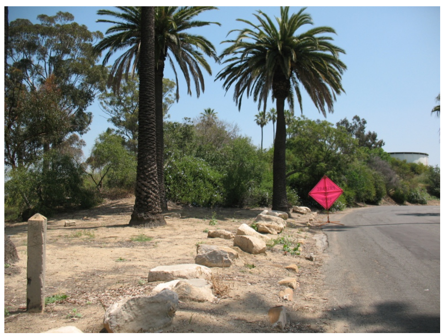
Photo 10. Photo depicting the approximate location where the proposed recycled and potable water pipelines would diverge from Angels Point Road bisect the hill and surrounding vegetation to connect with the proposed water tanks. Photo facing northeast.

Photo 9. Photo depicting the existing water tank and surrounding habitat on the hilltop by Elysian Fields. Photo facing north.