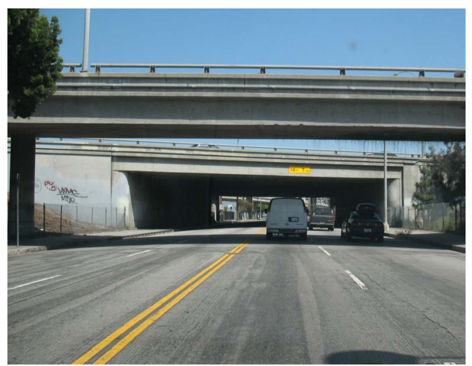
Photo 13. Photo depicting bridges and overpasses present along the Phase II proposed pipeline.