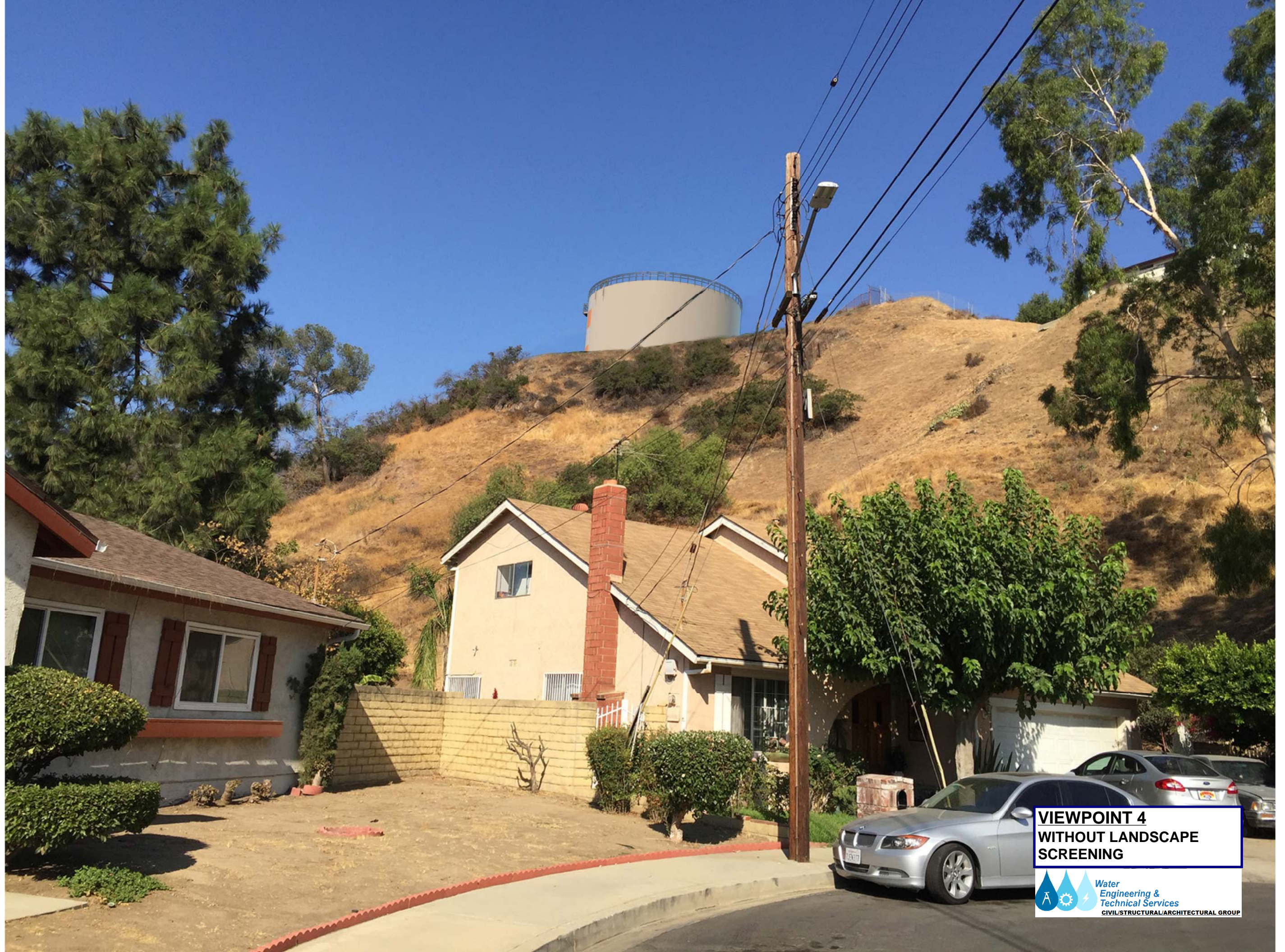
VIEWPOINT 4 WITHOUT LANDSCAPE SCREENING