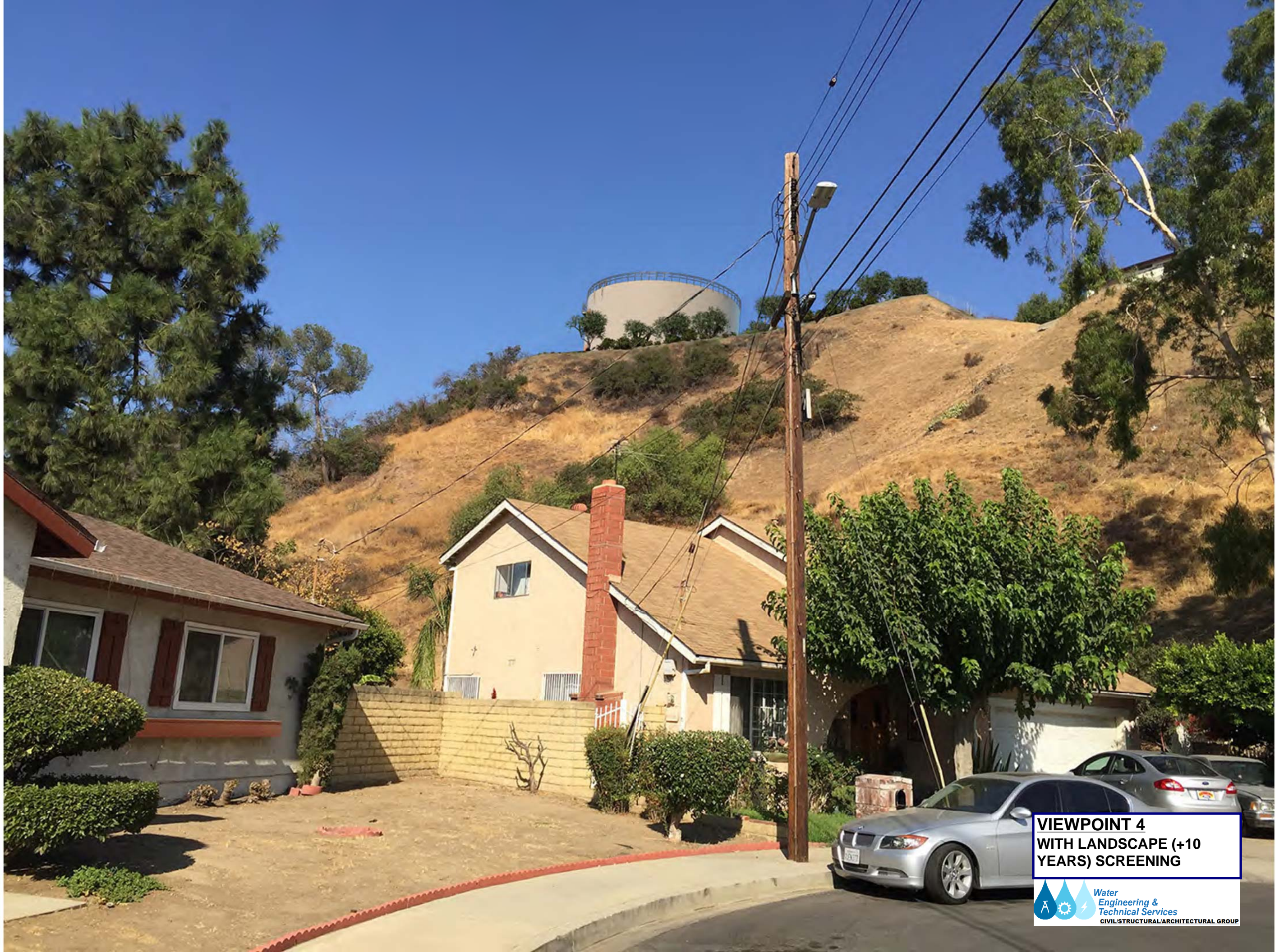
VIEWPOINT 4 WITH LANDSCAPE (+10 YEARS) SCREENING