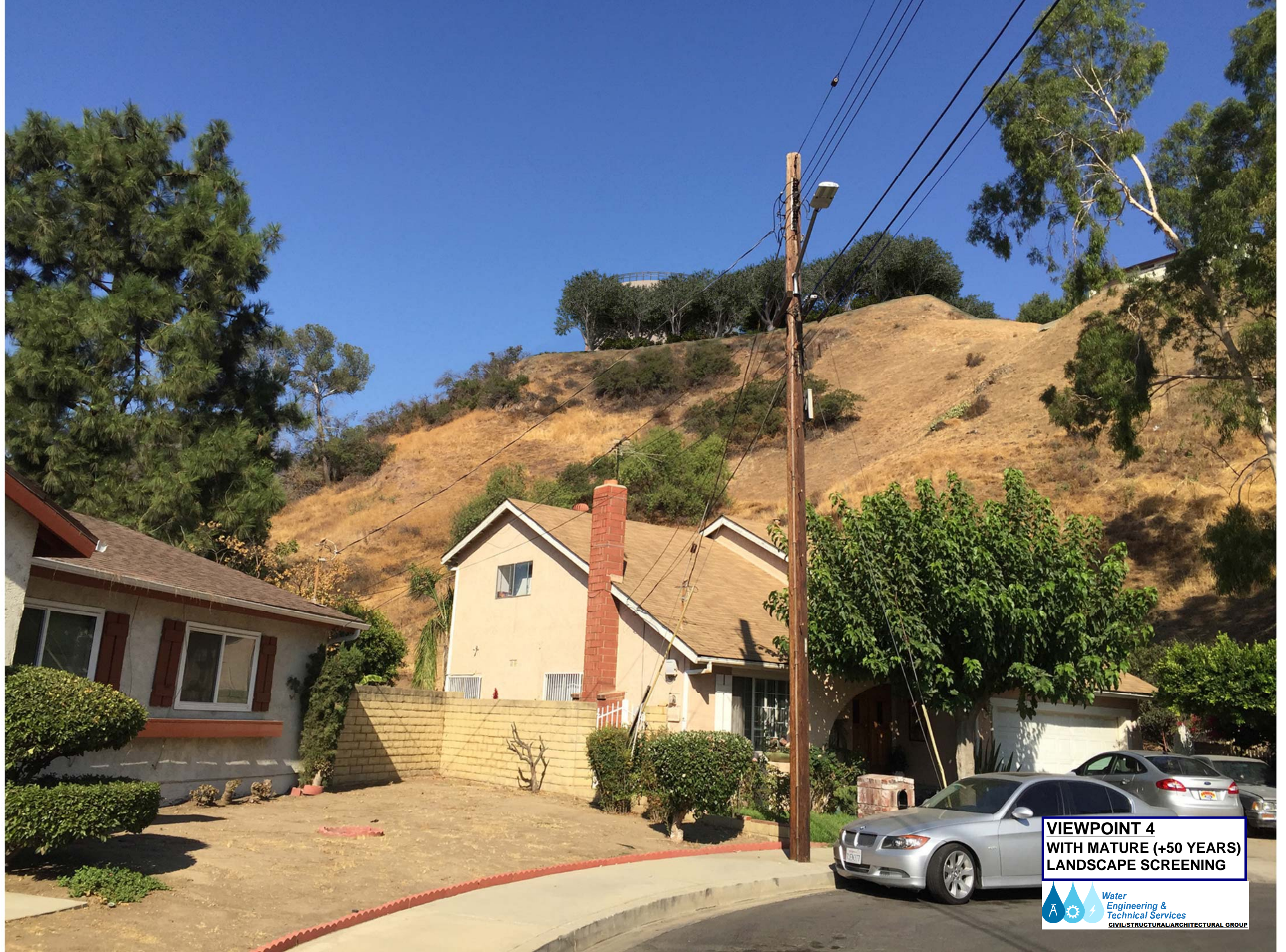
VIEWPOINT 4 WITH MATURE (+50 YEARS) LANDSCAPE SCREENING