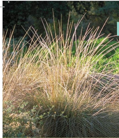
Deer Grass Muhlenbergia rigens

This native California grass is narrow-leafed and forms a dense clump up to 2-3 feet high and wide with flower stocks that can reach 6 feet high. The bright green leaves are joined by spiky cream-colored flowers in spring. The deer grass is drought tolerant and does best with little to moderate water in full sun or light shade. Deer grass can be fire-prone if not properly maintained and should not be planted within 5 feet of a structure. They attract birds and beneficial insects.